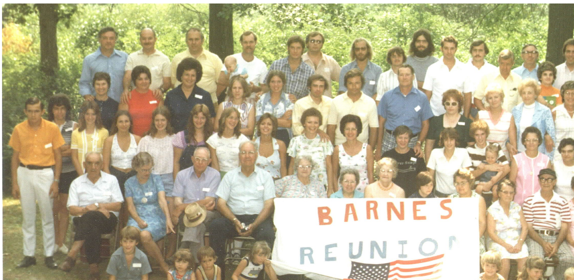
List of attenders as they appear in the picture: from front to back - left to right